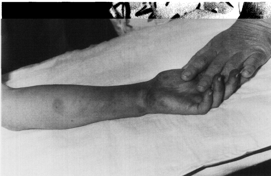
Figure 2 A tense swelling in the proximal third of the forearm with a bluish discoloration in the region of the fracture.