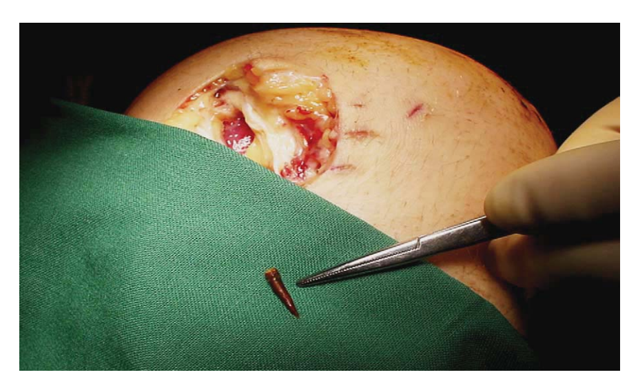
Figure 2 Intraoperative photograph demonstrating penetration of the thorn through the articular cartilage of medial femoral condyle.

articular cartilage appeared to be normal. Arthroscopic synovectomy of the inflamed synovium was performed and at this stage, a defect measuring 5 mm in the cartilage with a broken thorn found well embedded in the cartilage was seen. As it was firmly in the bone, joint was opened through a mini anteromedial arthrotom [Fig. 2]. A large thorn measuring 2 \text{ cm} \times 0.3 \text{ mm} removed. The granuloma surrounding thorn was curetted and was sent for histopathology and culture. He was given post operative intravenous flucloxacillin. Postoperatively there was dramatic improvement. The histopathology report was showed chronic