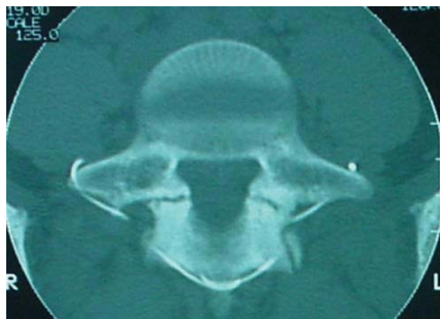
Fig. 1 Scott's procedure