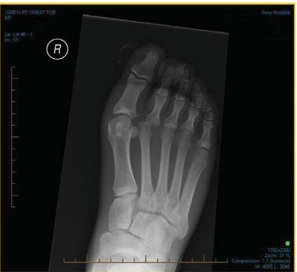
Figures 2AB Anteroposterior X-rays of the right foot showing dislocation of second and third metatarsophalangeal joints.

The foot was then placed in a short leg cast. Soon after the swelling had subsided, a walking heel was added and the patient was discharged encouraged to fully weight bear. The cast was removed in 6 weeks.