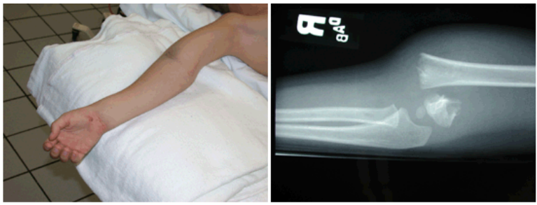
This child has a severe right supracondylar humerus fracture with complete displacement of the fracture fragments.

The doctor will first check to see whether there is any damage to the nerves or blood vessels.