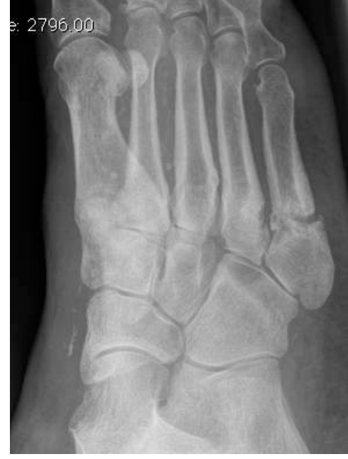
Different types of fracture at base of the V metatarsal. How do you manage this?