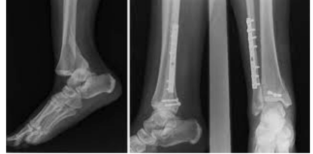
Direct fixation of posterior mallelus