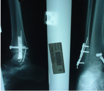
Indirect: Anterior to Posterior

To obtain an adequate reduction via this method, the fibula must first be fixed and brought out to length, as this will also provisionally align the posterior malleolus. Once the posterior malleolus has been brought down by the fibula, it is compressed from anterior to posterior with a clamp. Lag screws can then be placed through small stab incisions from anterior to posterior to compress the posterior malleolus into position.