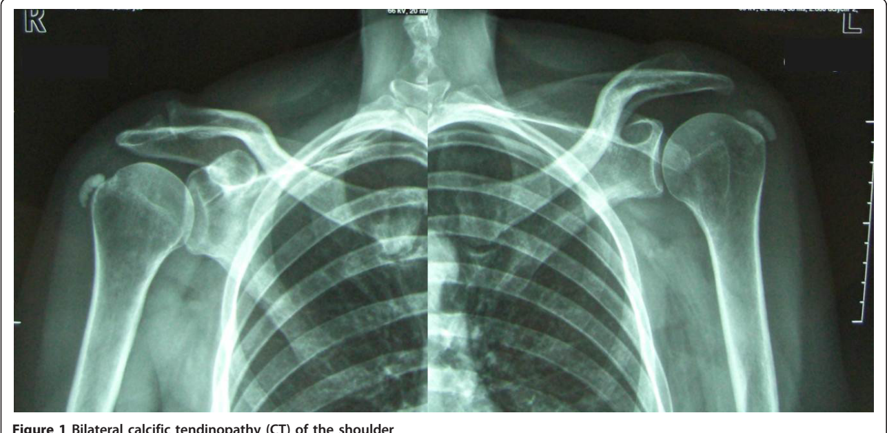
Figure 1 Bilateral calcific tendinopathy (CT) of the shoulder.

greater tuberosity is an uncommon and distinctive form of CT of the shoulder, and is associated with significantly poorer clinical and functional outcome both before and after surgical treatment [7]. Microscopic calcifications which are not detectable at plain radiography can also occur in chronic tendinopathy. A histological study showed high incidence of small calcium deposits in