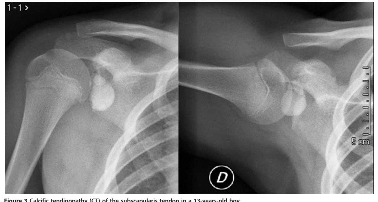
Figure 3 Calcific tendinopathy (CT) of the subscapularis tendon in a 13-years-old boy

Since ossified tendons will have increased stiffness, ossification can be seen as a localized attempt to compensate for the original decreased stiffness of the weak tendon. It is possible that the erroneous differentiation of tendon progenitor cells into chondrocytes or osteoblasts instead of tenocytes may contribute to the pathogenesis of CT. The mechanism leading to the erroneous differentiation of TDSCs is not completely understood. Probably, the expression of BMPs, biglycan, fibromodulin and an unfavorable micro-environment induced by overuse modify the natural healing process of the tendon. Conservative management modalities such as non-steroidal anti-inflammatory drugs (NSAIDs) or corticosteroids are often prescribed, and may further influence the pathways of the failed healing [75]. NSAIDs could modulate tendon cell proliferation [76,77], the expression of extracellular matrix components [78] and degradative enzymes in cells culture studies [46]. Corticosteroids can induce a