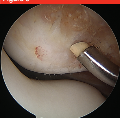
Arthroscopic view showing the inferior pole of the patella after the débridement of degenerative tissue.

by an earlier study by Giombini et al<sup>51</sup> that showed that hyperthermia was more effective than lowintensity pulsed ultrasonography for the treatment of patellar tendinopathy. All these modalities remain at an investigational stage and are not recommended for management of patellar tendinopathy.