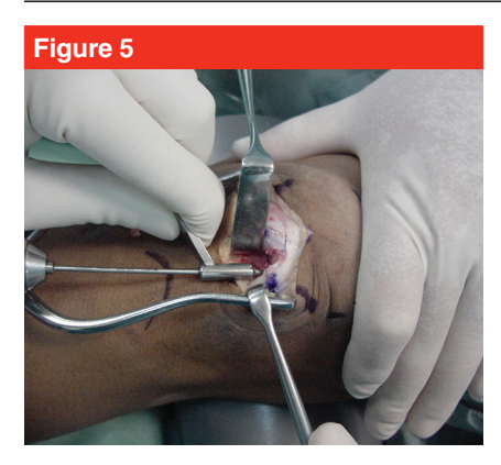
Intraoperative photograph depicting the open surgical technique. The inferior pole of the patella is perforated using a drill to produce a bleeding bed that promotes repair.

trinitrate delivers nitric oxide, which has exhibited a role in fibroblast proliferation, collagen synthesis, and the contraction of collagen lattices. Macrophage angiogenic activity, which is important for wound healing, also depends on nitric oxide synthase, and nitric oxide synthase activity is upregulated in tendinopathy.46 Based on the positive effects of glyceryl trinitrate reported in three studies of other types of tendinopathy,47-49 Steunebrink et al46 conducted a randomized study of patients with patellar tendinopathy comparing the use of a glyceryl trinitrate patch with that of a placebo patch. The authors did not find any difference in outcome between the two groups.