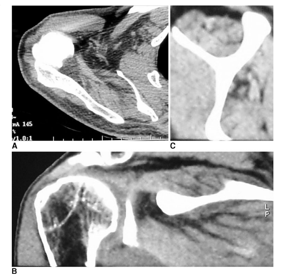
Fig. 1A–C Fatty infiltration of the supraspinatus was graded in soft-tissue sequences of the CT scan according to Goutallier classification [11]. The average of values determined in (A) axial, (B) coronal, and (C) sagittal plane was defined as the final stage of fatty infiltration.

One of us (BM) also measured muscular atrophy indirectly using the tangent sign on the most lateral cut of the sagittal plane where the spine appears in contact with the scapula on the MRI/CT as described by Zanetti [26] (Fig. 3). A healthy supraspinatus should cross a line drawn for the superior border of the coracoid process to