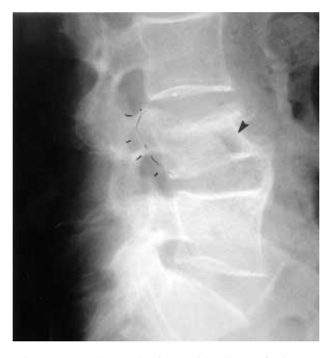
Fig. 1. — Lateral xray showing partial collapse of L4 vertebrae in a patient with Kummell's disease. See arrow pointing to intraosseous air.