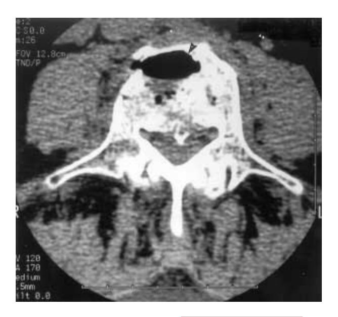
Fig. 3. — Axial CT scan of L4 vertebral body showing intraosseous air (see arrow).

cases of malignancy and intraosseous disc prolapse. The intravertebral vacuum cleft sign is probably not pathognomonic of Kummell's disease, but may be highly suggestive of it.