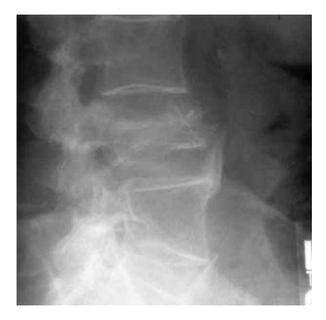
Fig. 2. —Lateral xray taken one month after xray in figure 1 showing progression of collapse.

cases of malignancy and intraosseous disc prolapse. The intravertebral vacuum cleft sign is probably not pathognomonic of Kummell's disease, but may be highly suggestive of it.