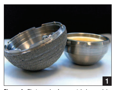
Figure 1: Photograph of an acetabular modular ceramic bearing system showing a peripheral self-locking titanium shell and a recessed metal-backed alumina liner. Anti-rotation and Morse-taper locking mechanisms are also shown.

Nevertheless, increasing concern has arisen from various reports that describe a significant prevalence of malseating of the metal-backed alumina liner. Based on a retrospective radiographic review, Langdown et al<sup>15</sup> demonstrated that 16.8% of the liners from 117 ceramic-on-ceramic primary THAs were improperly seated. In