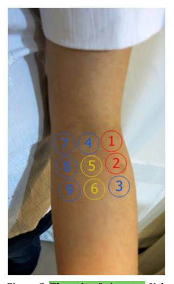
Figure 2. The rule of nine test: Volar side of left proximal forearm, distal to elbow crease is divided to nine pressure points in three columns. Tenderness over two proximal lateral circles (red circles) indicates radial nerve irritation while tenderness over pressure points of 5 and 6 (yellow circles) indicates proximal median nerve irritation. Three medial points are control area.

nerve by extending the elbow, pronating the forearm, or flexing the wrist. Two accepted clinical tests to confirm the diagnosis include exacerbation of the pain with resisted supination with the other being increased pain in the proximal radial forearm and over the radial tunnel when the wrist is hyperextended against resistance (1, 17). Studies have concluded the pain elicited with resisted middle finger extension as a pathognomonic sign in diagnosing of RTS (1). However, other studies noted the pain is rarely induced during resisted extension of the middle finger (17). Electromyography (EMG) and nerve conduction velocity (NCV) studies in patients with RTS are typically negative (18, 19).