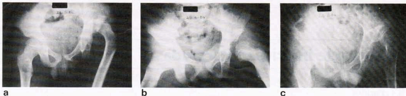
Figure 3. An 18-month-old neglected posterior dislocation of hip initially treated by massage. a , Fracture-dislocation left hip. b , Non-concentric reduction after 3 weeks of heavy traction. Patient refused surgical reduction. c , After 6 months he presented with redislocation and had poor clinical results.

arthritis (Stewart and Milford, 1954; Brav, 1962; Epstein, 1973). It is generally conceded that the end result following posterior dislocation is dependent on the age of the patient, type of dislocation and severity of initial trauma (Funk, 1962; Epstein, 1973).