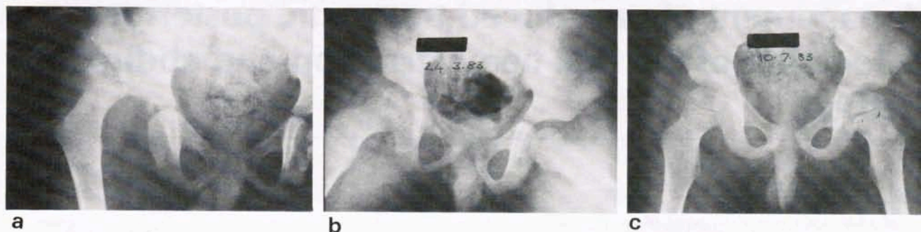
Figure 1. Six-month-old posterior dislocation of right hip in a 6-year-old child. a , Before reduction. b , Result 3 weeks after heavy traction and abduction. c , Six months after reduction. Four years after reduction, the range of motion of the hip joint was normal.

Skeletal traction was applied through the lower femur or upper tibia, for a period of 2 to 3 weeks. With a traction of 4.5–13.6 kg (10–13 lb), over-reduction was achieved in all eight cases. Gradual reduction of the femoral head into the acetabulum was then accomplished by abducting the limb and reducing the traction to 2.3–3.2 kg (5–7 lb) for 3 weeks.