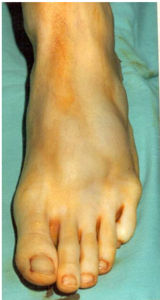
Figure 2 Massive left foot ganglion cyst to the dorsum of the foot.

Statistics as to sex incidence vary, but most report a higher incidence in women. Subcutaneous ganglions are most common in the regions of the dorsum of the hand, palmar aspect of the wrist, palmar aspect of the fingers and dorsum of the foot. Recently intra-osseous ganglion, intraneural and intraligamentous ganglions have been described. 4,5,6