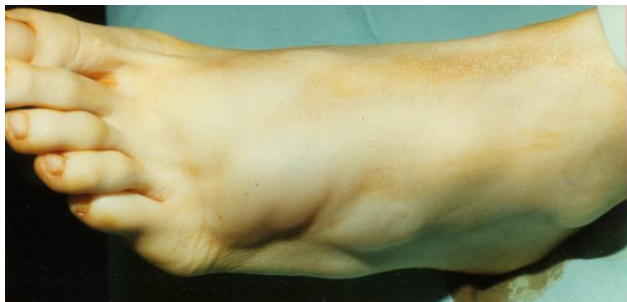
Figure 1 Massive left foot ganglion cyst.

Surgical excision was performed. The mass separated from the surrounding skin quite easily. It appeared to be arising from the extensor tendon of the foot. (Fig. 3) There was a well-defined capsule. The fluid of swelling is gelatinous and is typical of ganglion fluid. Histological examination showed a benign ganglion. At 2 year's follow-up, there was no recurrence. The patient was able to wear his proper footwear.